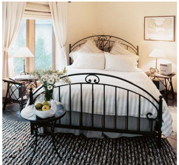
Bedroom at the Arbor House inn.